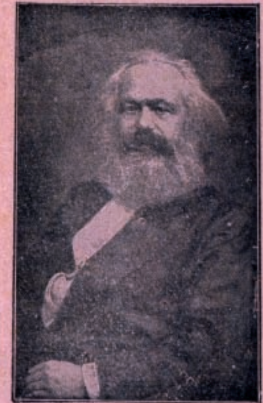
المائید سوسیالیزمک موجدی قارل مارکس

اشتراک کونل بر مقصدی: عثمانلی سوسیالیست کیتخانه سی نای آله سوسیالیزم افکارنه عالمده بر کلیات وجوده کتیر مک بیتنددیز عمله نک حیاته، جمعیت بشریه نک معادت آیه سنه اساسی اوله یله جک قواعد و نظریات اجتماعی نی بو کیتخانه ایله قارئلر مزه کوسترمک آکلا تئق ایسته یوروز سوسیالیزم رهبر عمله نامنده کی ایلمک رساله انتشار ایتمشدر