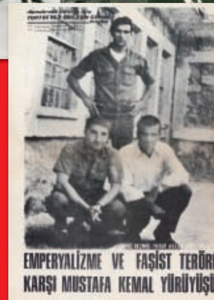
A second coup in 1971 led to a complete setback. Student leaders Deniz Gezmis, Yusuf Aslan, and Hüseyin Inan were sentenced to death by a military court and hanged.