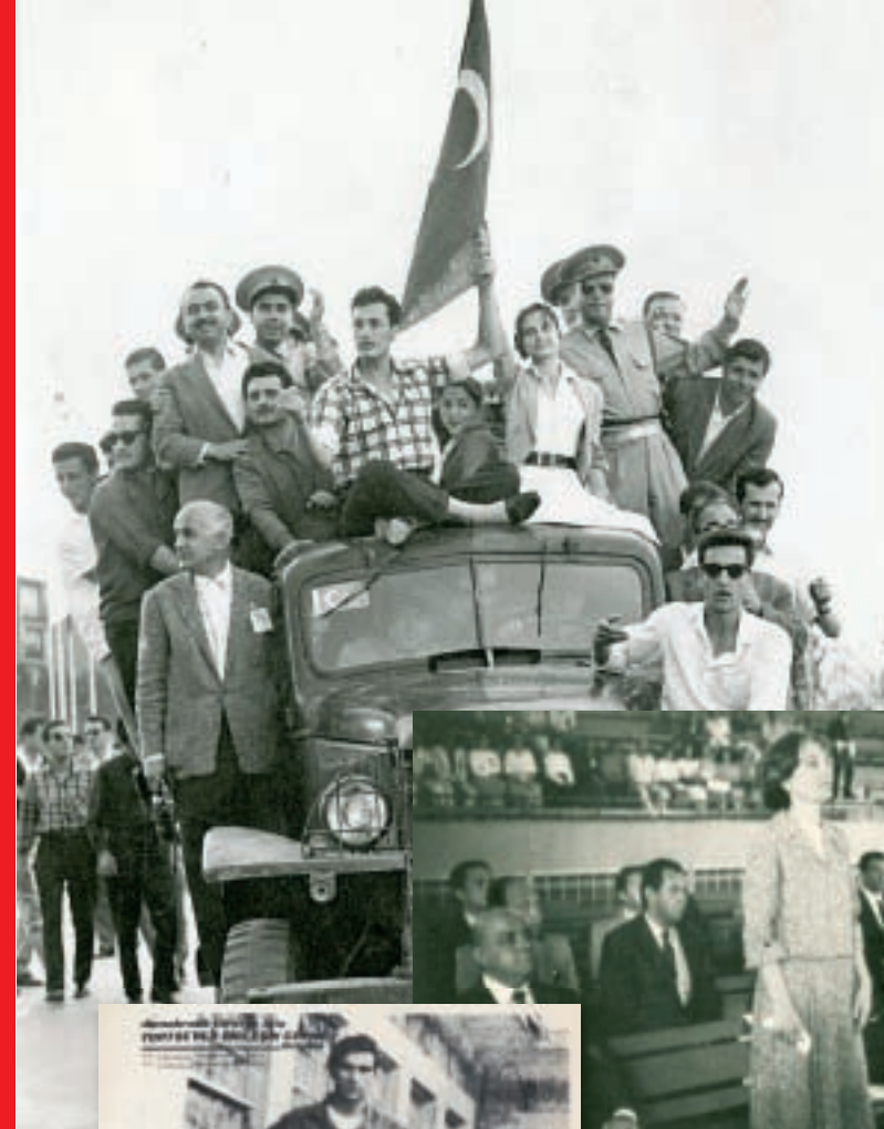
Student demonstrations in May 1960 against the rightist regime Menderes led to a coup by the military and an ensuing liberalization. Students and soldiers celebrated victory together.

Nowadays, more than five million former inhabitants of Turkey live abroad. Compared to other ethnic groups that have emigrated, the propensity to organize among former Turkish nationals is strong. On the one hand, their political organizations in the diaspora reflect the polarized situation in their homeland, on the other, they are influenced by the mores of their host country. The special women's branches of Turkish organizations in Holland mirror Dutch rather than Turkish emancipatory ideals.