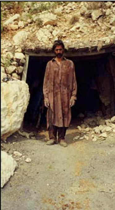
A Mineworker in front of his' mineshaft.

The research focuses on labour contracts between the various parties. The roles and relations between the actors in the recruitment system are examined in some detail. It takes into