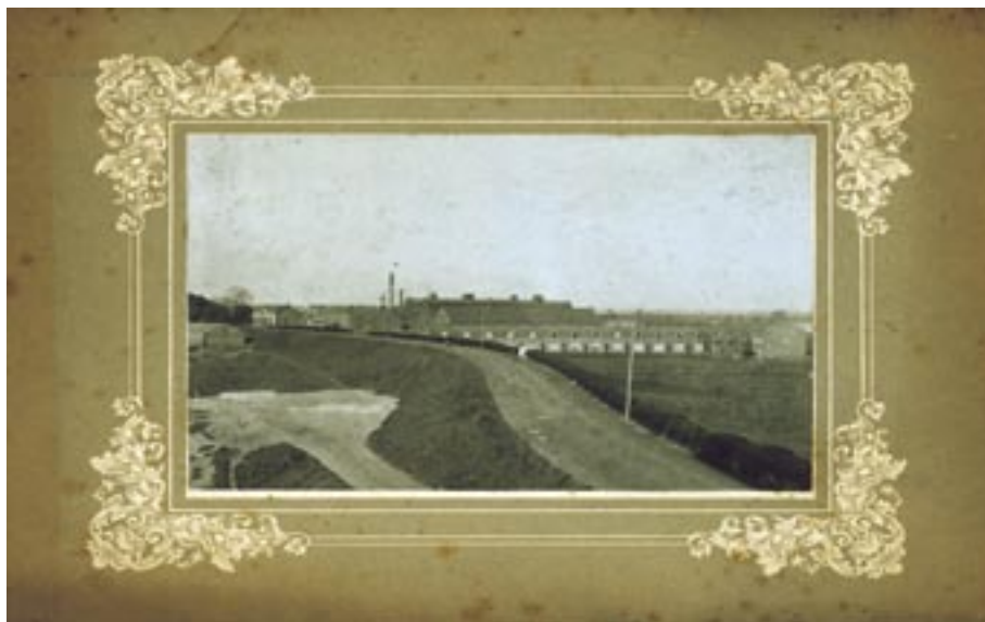
VIEW OF THE GLASS FACTORIES IN LEERDAM, BEHIND THE DIKE ON THE LINGE RIVER. RIGHT: WORKERS' QUARTERS OF ONE OR TWO STOREYS, PHOTO CA. 1900.