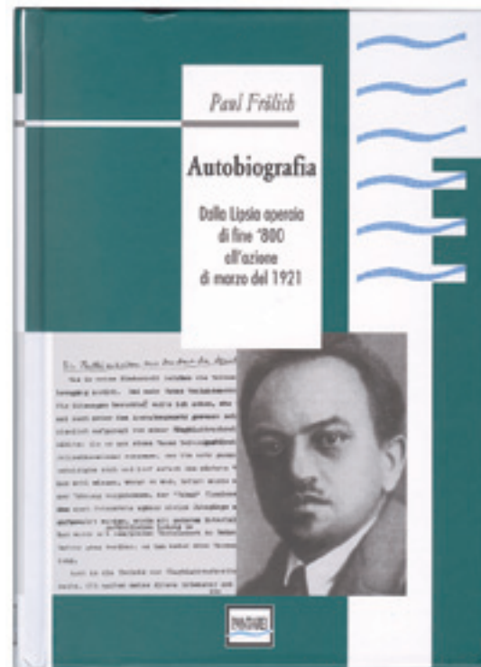
THE ITALIAN EDITION OF PAUL FRÖLICH'S MEMOIRS, 2010