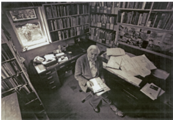
COLIN WARD IN HIS HOUSE IN KERSEY UPLAND, SUFFOLK, 20 JULY 1993

he said, germinate like seeds under the snow of capitalism, bureaucracy, and nationalism. His books were translated into several languages and widely distributed outside the UK. In addition to his extensive correspondence and the texts of articles, lectures, books, and reviews, the archive (7.85 m) comprises eleven scrapbooks about architecture and his work, kept from 1943 until 1999. The Friends of the IISH were kind enough to pay for transportation of the papers and related expenses.