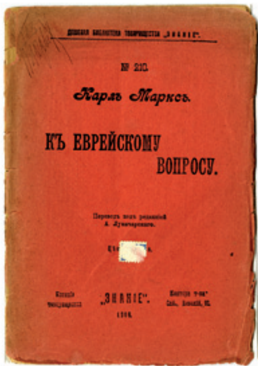
COVER OF THE FIRST RUSSIAN EDITION OF KARL MARX, 'ON THE JEWISH QUESTION', GENEVA 1906 (IISH LIBRARY BRO 5877/5)

RESPONSE TO A SURVEY BY GEMEENSCHAPPELIJK GRONDBEZIT FROM EKEREN, BELGIUM, 20 JULY 1903 (IISH, ARCHIEF GGB)