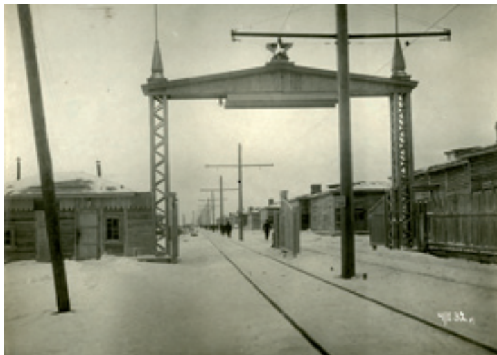
'WORKMEN [']S HOUSES WITH ENTRANCE AND TRAMWAY LINE,' PHOTOGRAPH TAKEN IN AVTOVO ON 4 JANUARY 1932