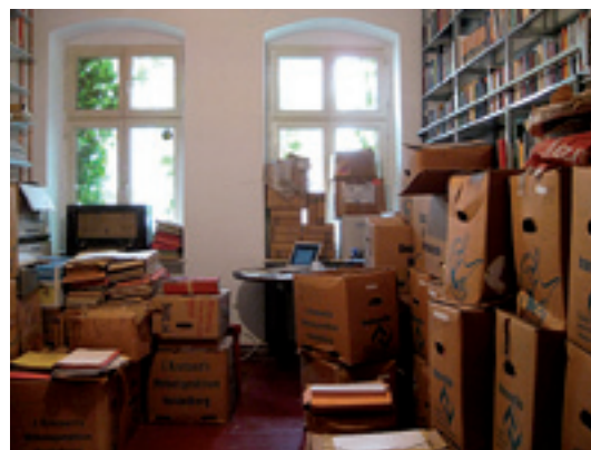
VIEW OF THE ARCHIV SOL- DATENRECHTE IN BERLIN IN SEPTEMBER 2010