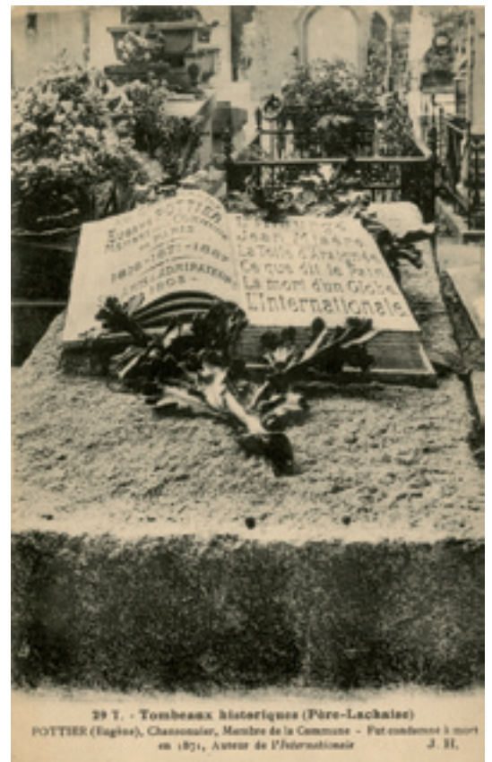
29 T. - Tombeaux historiques (Père-Lachaise) POTTIER (Eugène), Chansonnier, Membre de la Commune - Fut condamné à mort en 1871, Auteur de l'Internationale

Preliminary exploration of labour movement music items at the Institute reveals that such material is abundant, has not undergone a