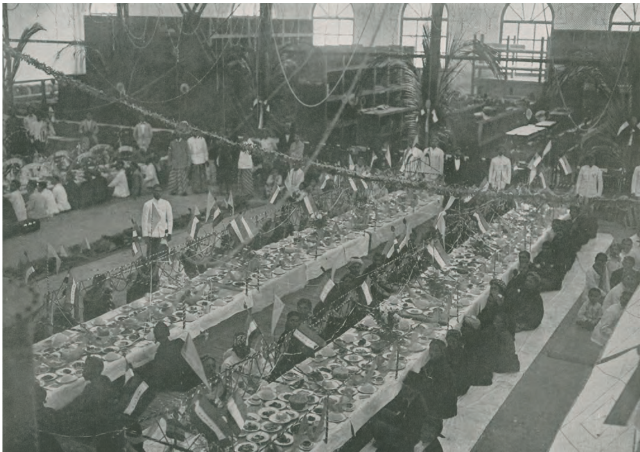
TRADITIONAL GRINDING FEAST, HELD IN THE FACTORY HALL BEFORE THE START OF THE SUGAR CANE CAMPAIGNS, FROM DE SUIKER-FABRIEKEN WATOETOELIS EN POPPOH IN BEELD, THE HAGUE, 1926, IISH LIBRARY, EHB 251/B/29

trative experience and familiarity with the Caribbean, as well as his experience as a land owner near Batavia, made him an expert on sugar production.