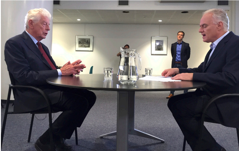
IISH interview with Wim Kok, (left) former chair of the dutch union and former Prime Minister.