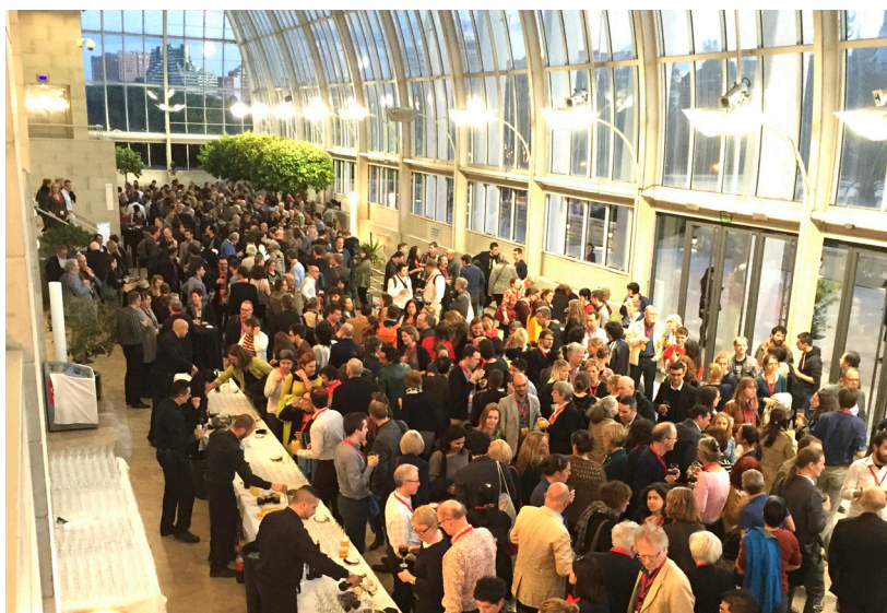
European Social Science History Conference (ESSHC)

Work and labour relations deeply influence how we live. The International Institute of Social History (IISH) examines how these relations develop globally over time. To conduct this historical research and support other researchers, we collect archives and data from all over the world. Established in 1935, the IISH is one of the world's leading research institutes on social history.