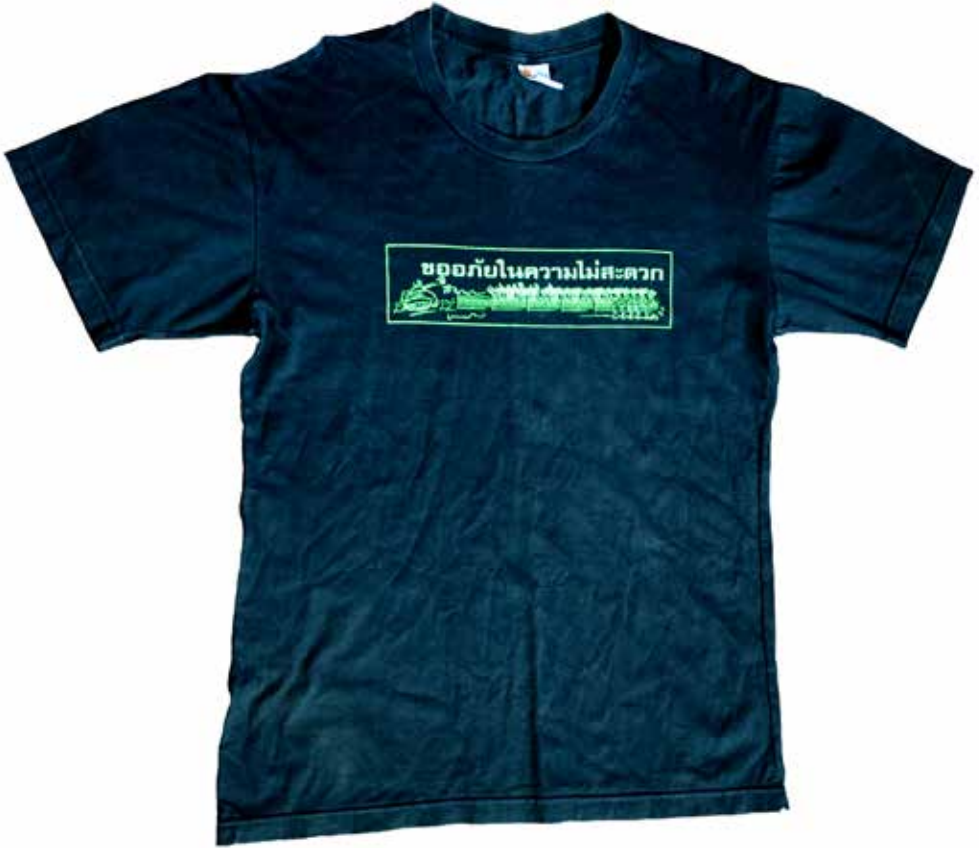
The first T-shirt produced against the military coup of 2006 in Thailand. The text reads: 'Sorry for the inconvenience'