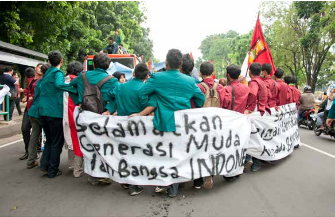
One of the many student rallies on 14 November 2011 in Jakarta. The banner reads: 'Congratulations new generation and people of Indonesia'