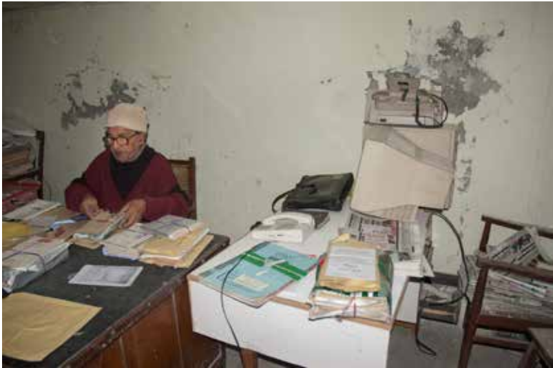
Office of the Socialist Party (Lahore, Pakistan)