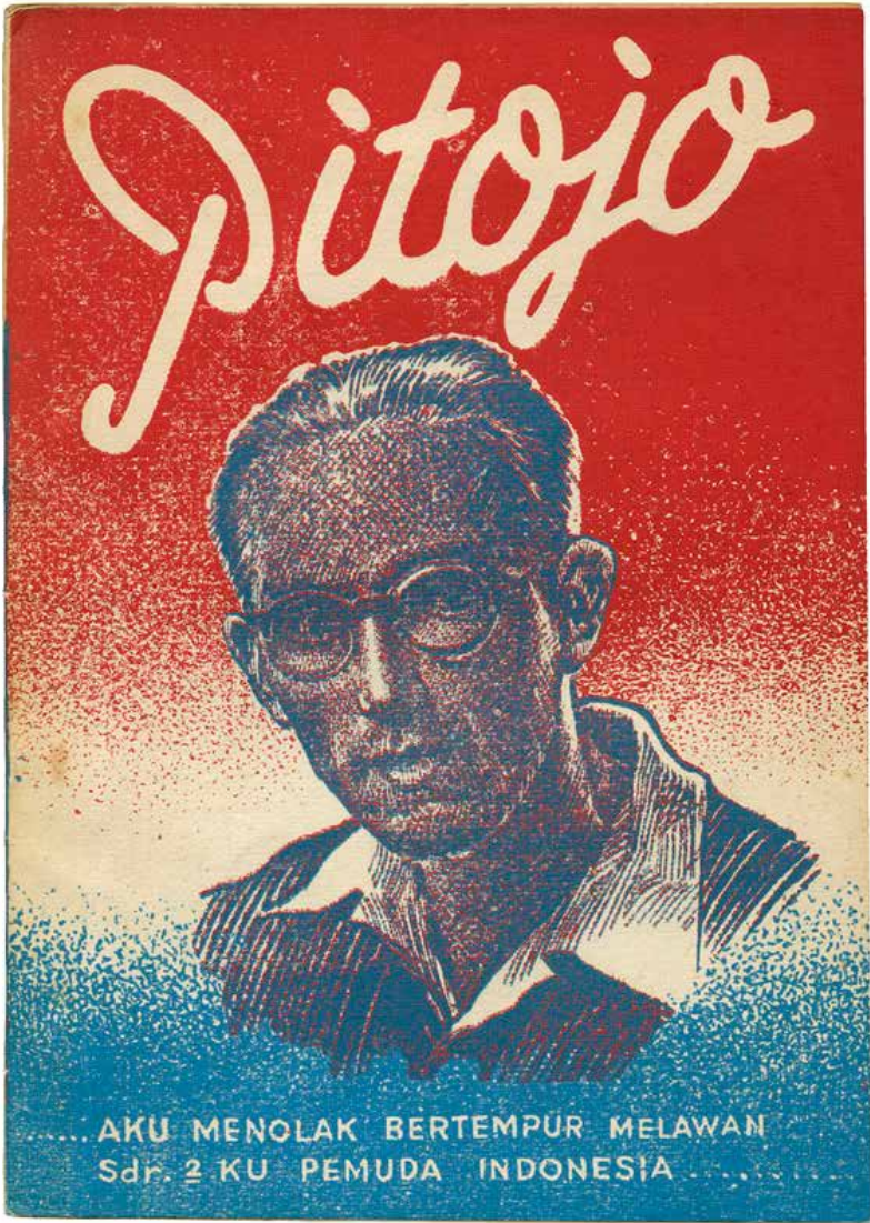
Booklet on Pitojo, or Piet van Staveren. See Collection 136. (IISH Collection: Bro 2370/8)