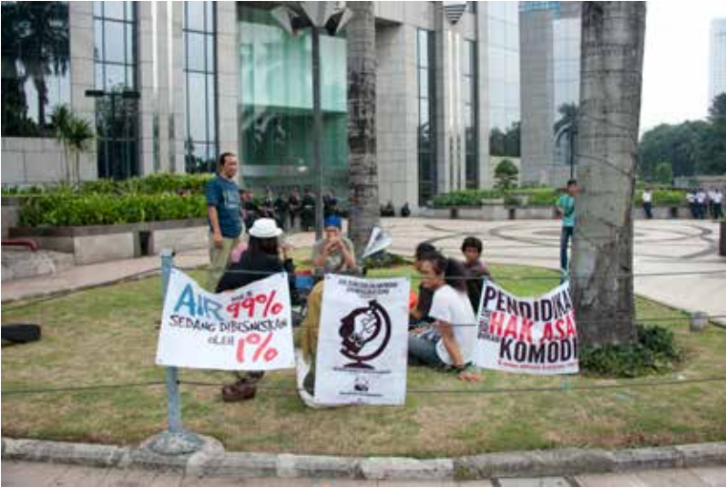
Duduki Jakarta / Occupy Jakarta, camping out every afternoon in front of the Bursa Efek Jakarta (November 2011)