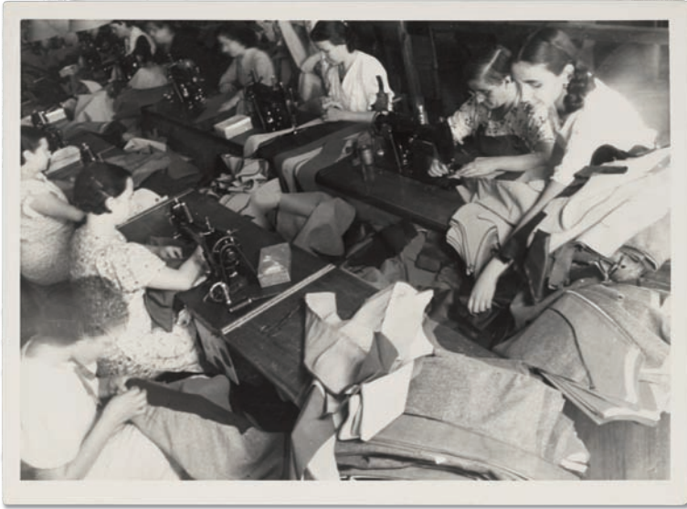
Collectivized textile workshop producing clothing for the militias, Barcelona 1936.