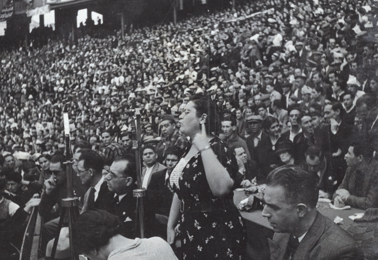
Mass meeting of the anarchist and socialist movement on the Plaza de Toros Monumental, Barcelona, 25 October 1936. Federica Montseny is speaking.