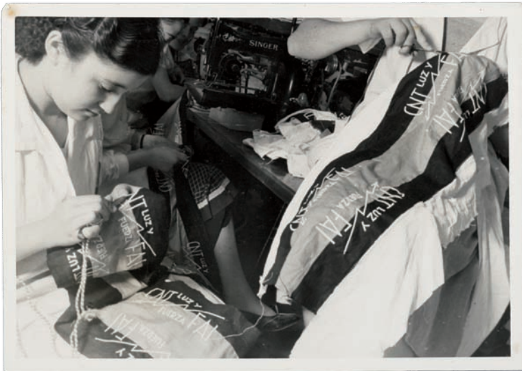
Collectivized textile workshop, producing ribbons for the CNT/FAI union 'Luz y Fuerza' (workers in the gas, water and electricity sector), Barcelona, 1936