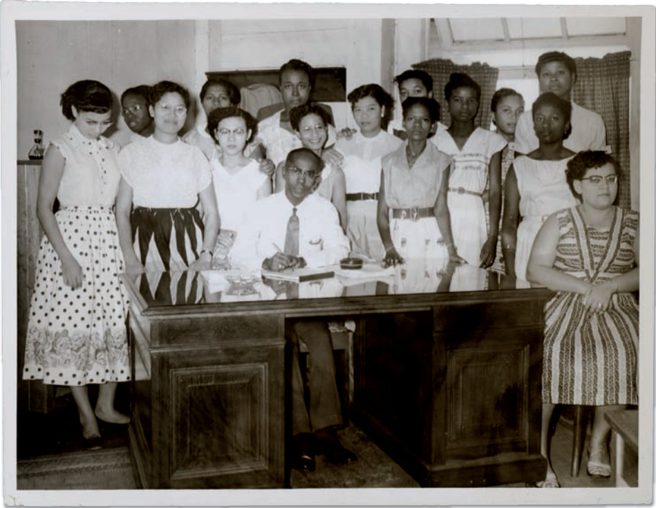
Surinamese nurses, 1957

Taken at the departure from 's Lands Hospitaal (Paramaribo) in February 1957 of the first group of student nurses recruited by the Maasoord psychiatric institution in Poortugaal.