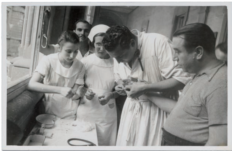
Donating blood for the injured, Barcelona, 1936.