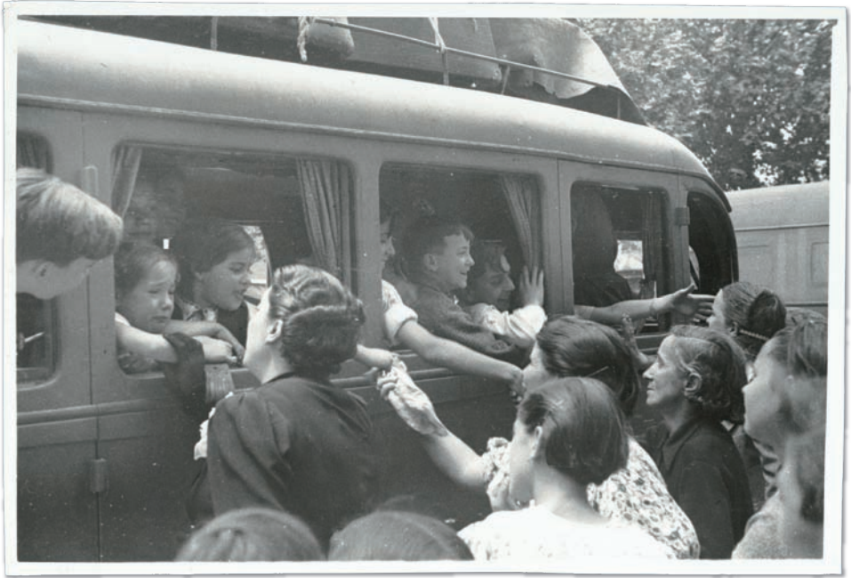
Children are evacuated to France, 10 June 1938. The evacuation was organized by the Ministry of Public Education and Health.