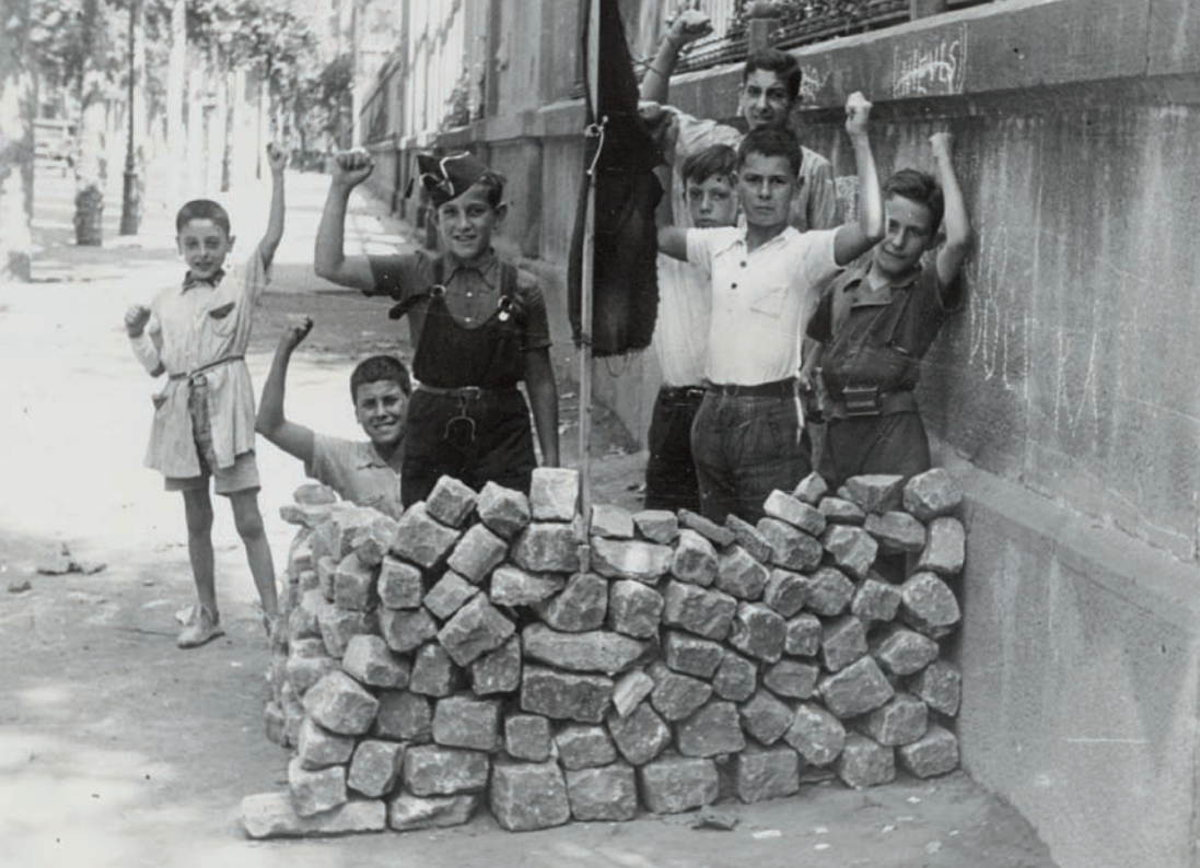
Children 'playing barricade', Barcelona 1936.