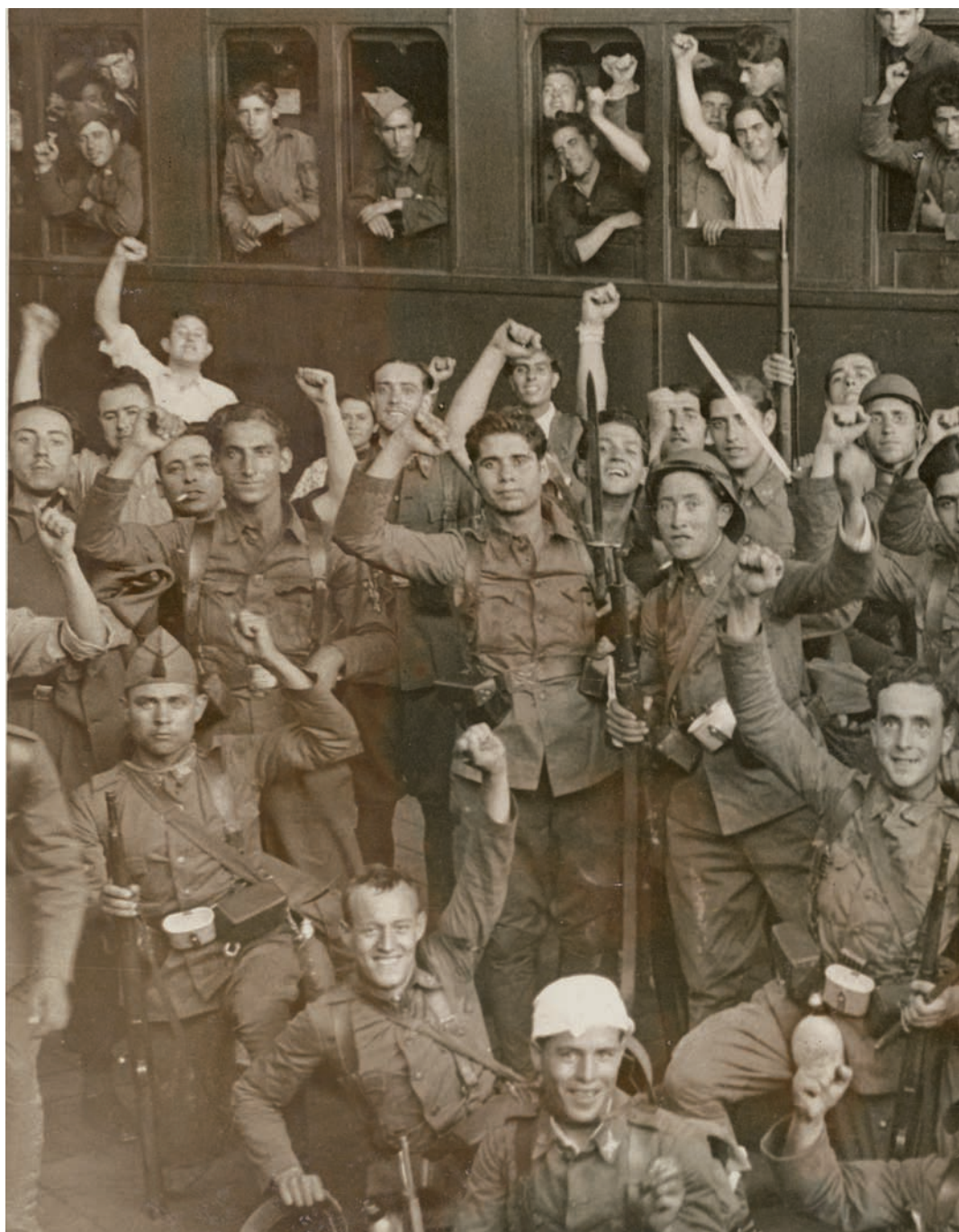
Members of the Columna García Oliver, an anarchist militia, leaving for the front at the Northern Station, Barcelona, 27-28 August 1938.