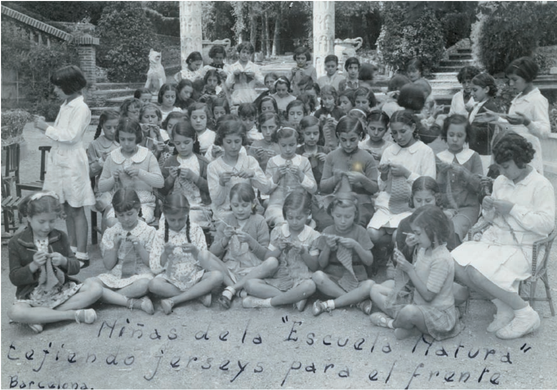
Children of the Escuela Natura (Nature School) knitting jerseys for soldiers at the front, Barcelona, undated.