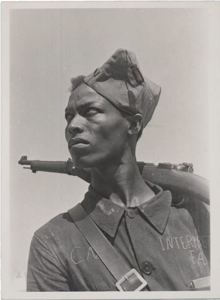
A black volunteer in the CNT/FAI militia. His uniform is that of an interpreter. 1936.