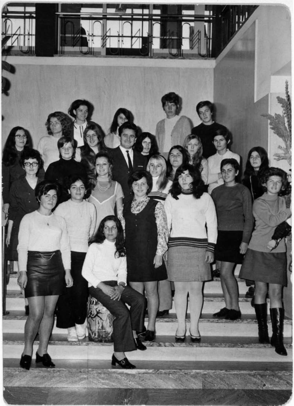
Yugoslav women workers, ca. 1970

Active recruitment by Laurens cigarette factories in The Hague brought dozens of Yugoslav women to the production department between 1969 and 1973.