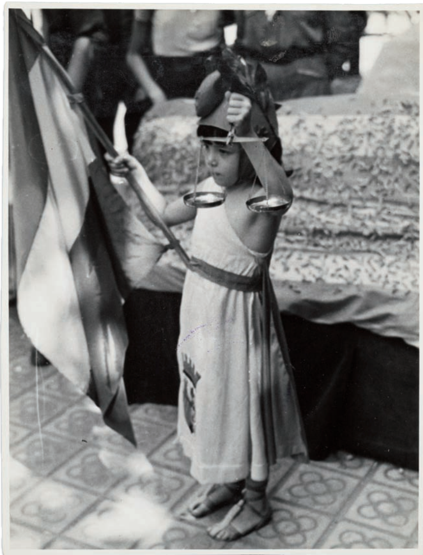
A child dressed up as an allegory of Justice during the commemoration of Rafael Casanovas, 11 September 1936. Casanovas led the defence during the siege of Barcelona by a Franco-Spanish army in 1714. He led a famous charge on 11 September, which became the National Day of Catalonia.