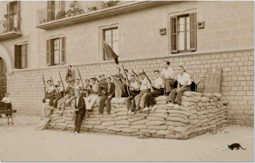
A barricade in the Sagrera district of Barcelona, in front of the 'Casa de la CNT/FAI', 19-20 July 1936. On these dates left-wing militias blocked a military coup led by General Franco.