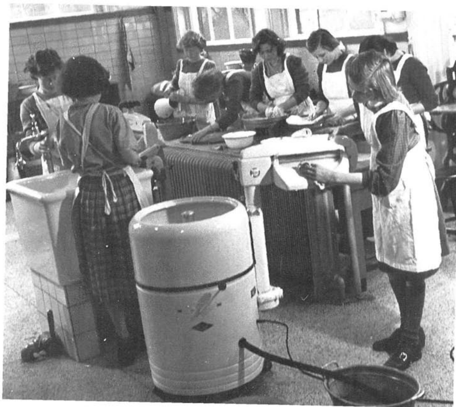
Learning how to do the laundry at technical college for girls, Amsterdam (ca. 1952)