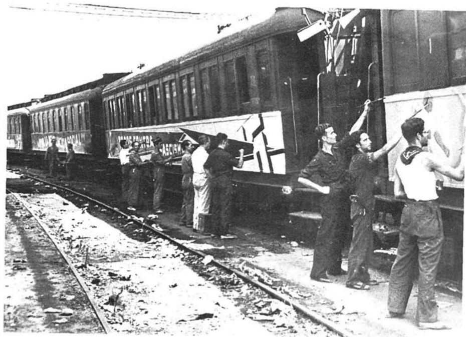
Spanish Civil War (1936-1939): trains painted by members of the trade union of designers and painters (photo from the collection of the Confederación Nacional del Trabajo ; the classification of this collection was completed in 1985)