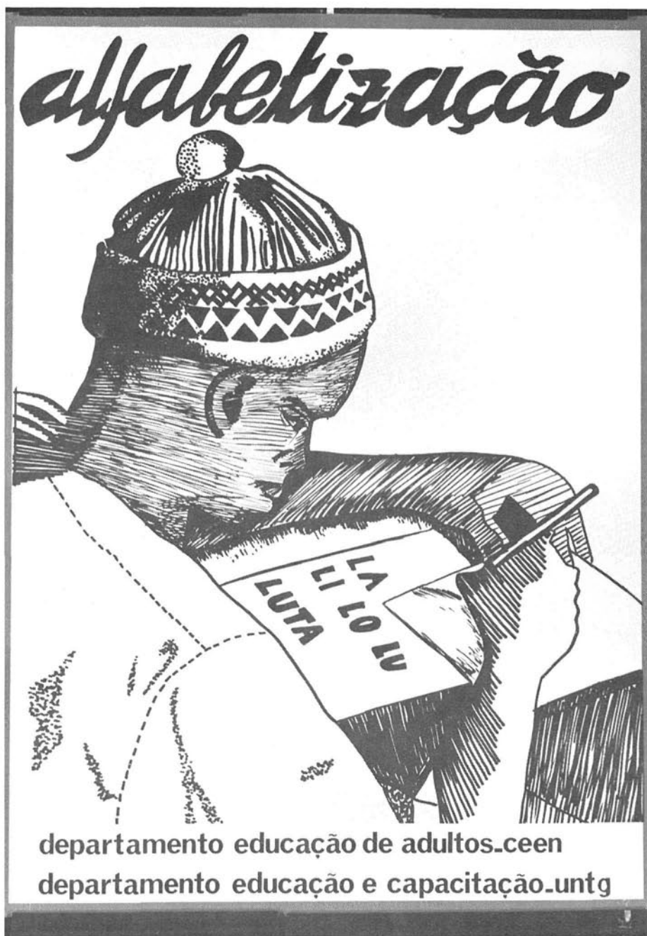
Poster from Guinea-Bissau, 1977, from the collection donated by the Komitee Zuidelijk Afrika, 1985