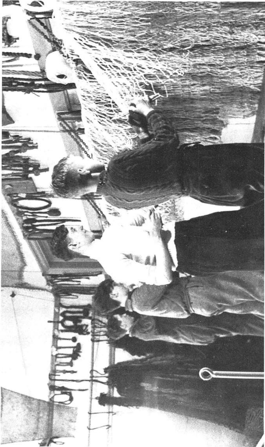
Fishermen's school, IJmuiden (ca. 1952)