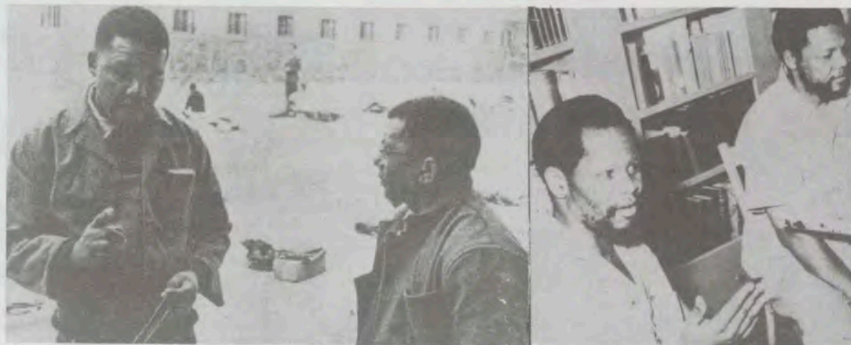
Nelson Mandela with Walter Sisulu in Robben Island prison in 1966 (left), and with Oliver Tambo in Addis Ababa in 1962.