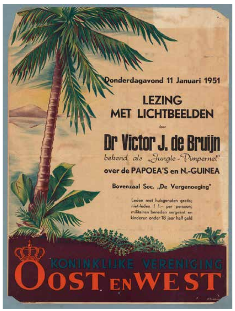
Poster announcing a lecture with slides of Victor de Bruijn in 1951 on Papua's and Niew Guinea in 'Royal Society East and West'