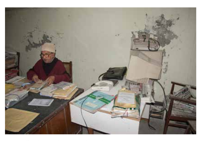
Office of the Socialist Party (Lahore, Pakistan)