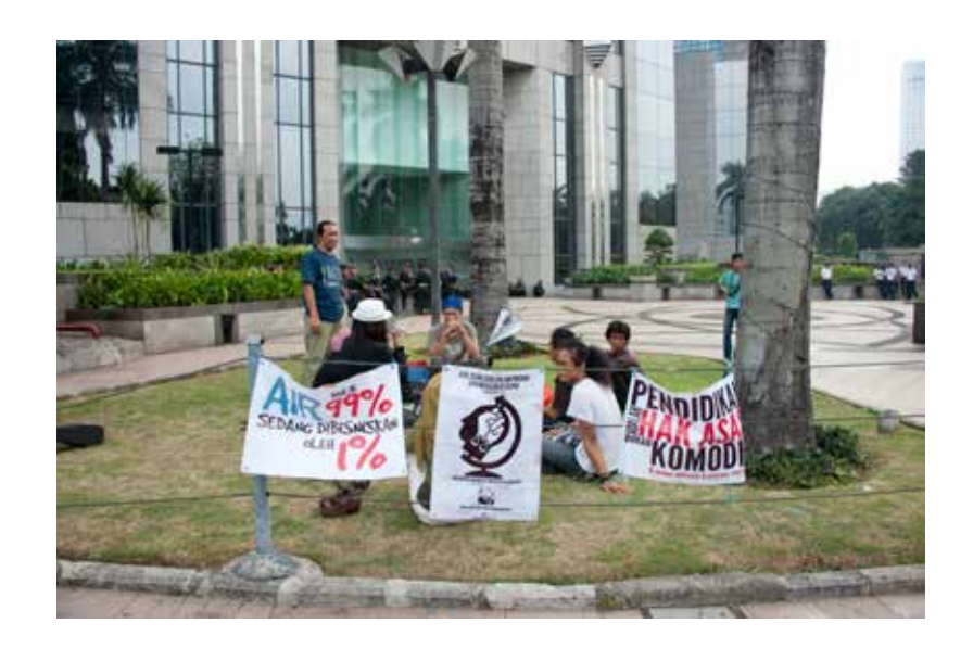
Duduki Jakarta / Occupy Jakarta, camping out every afternoon in front of the Bursa Efek Jakarta (November 2011)