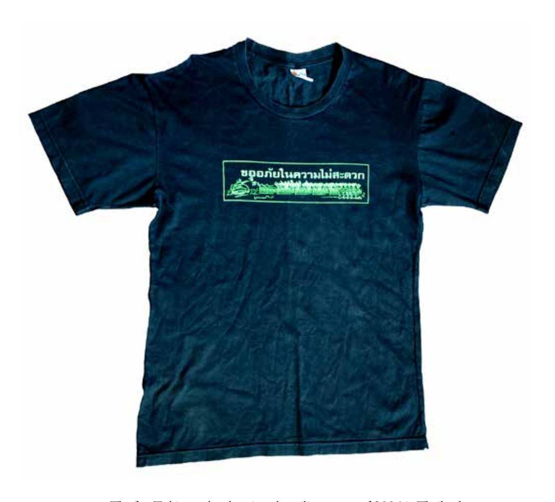
The first T-shirt produced against the military ccoup of 2006 in Thailand. The text reads: 'Sorry for the inconvenience'