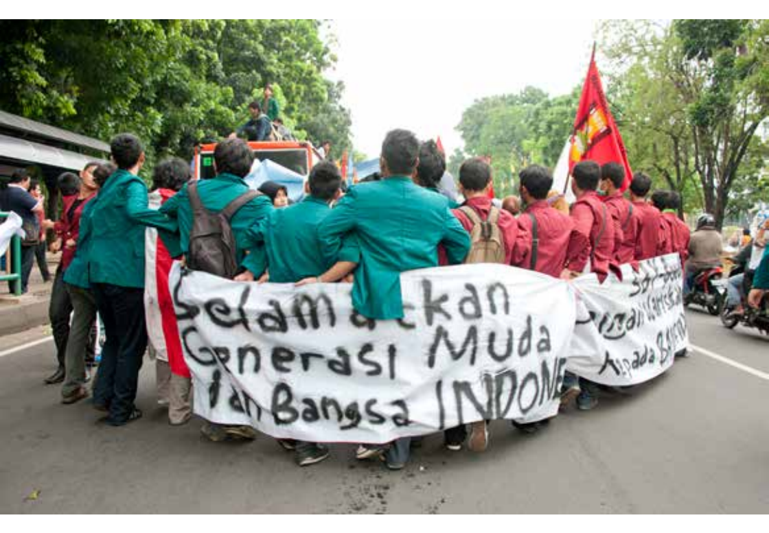
One of the many studentrallies on 14 November 2011 in Jakarta. The banner reads: 'Congratulations new generation and people of Indonesia'